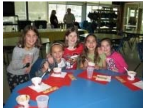
Poster Contest Sundae Parties

Check out what the town is offering this winter HERE .