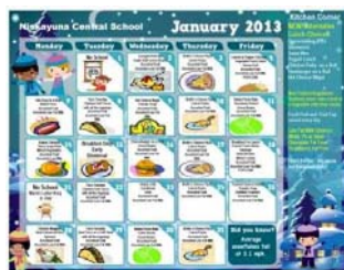
January Lunch Menu