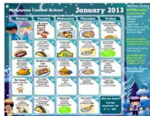
January Lunch Menu

See all events on the school calendar or PRINT the February school calendar (pdf).