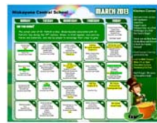
March Lunch Menu

There are still volunteer positions open for next year. We'd love to fill these slots by the end of the month to help with next year's planning. A tentative "yes" is fine! Scroll the list and see what you can help with: