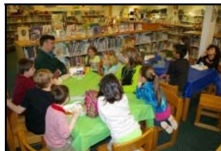
A few lucky students had dessert with