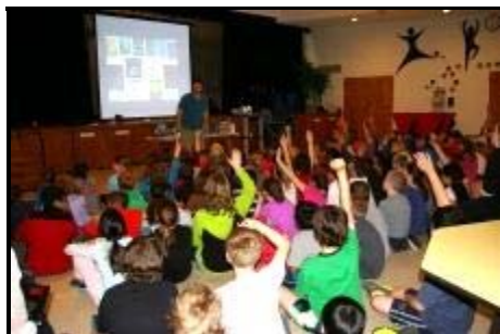
Birchwood students listen to author