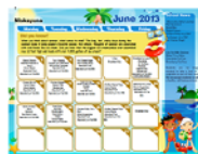
June Lunch Menu

Fri., June 21st -- Last day of school, 10:45am dismissal